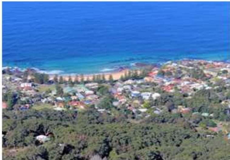
Looking down on Austinmer Beach from Sublime Point